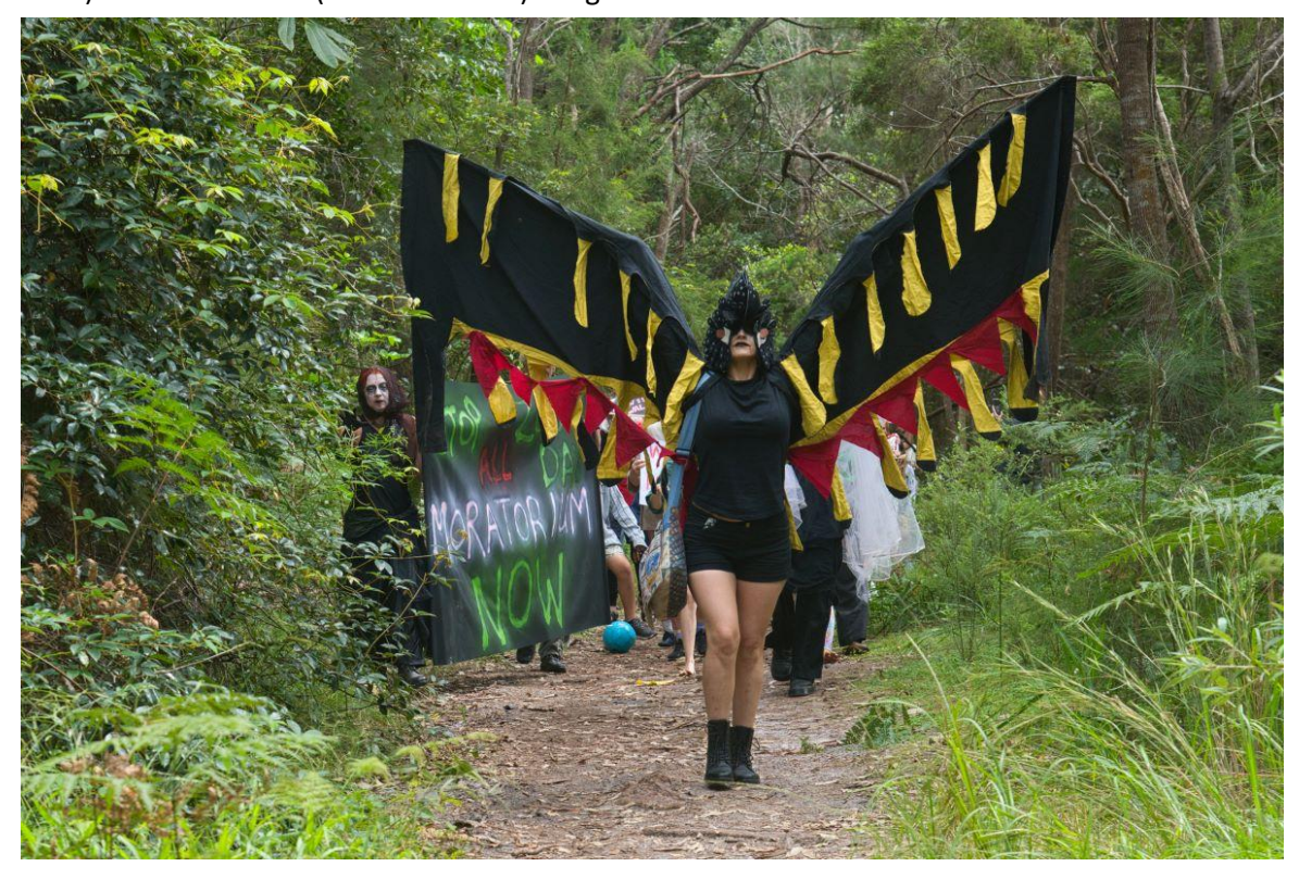
4) Save Wallum Zombie March