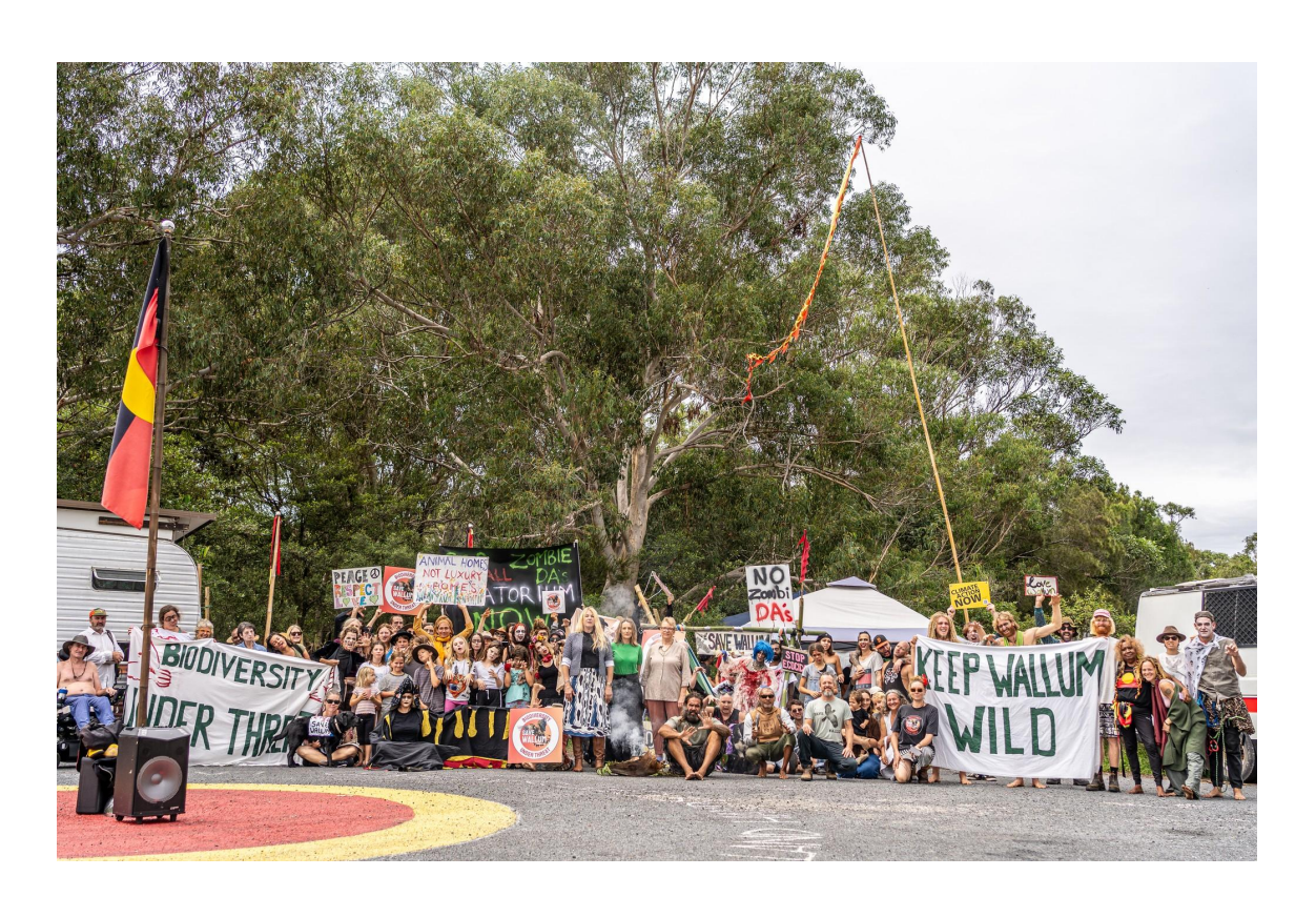
3) Zombie March (Black Cockatoo)