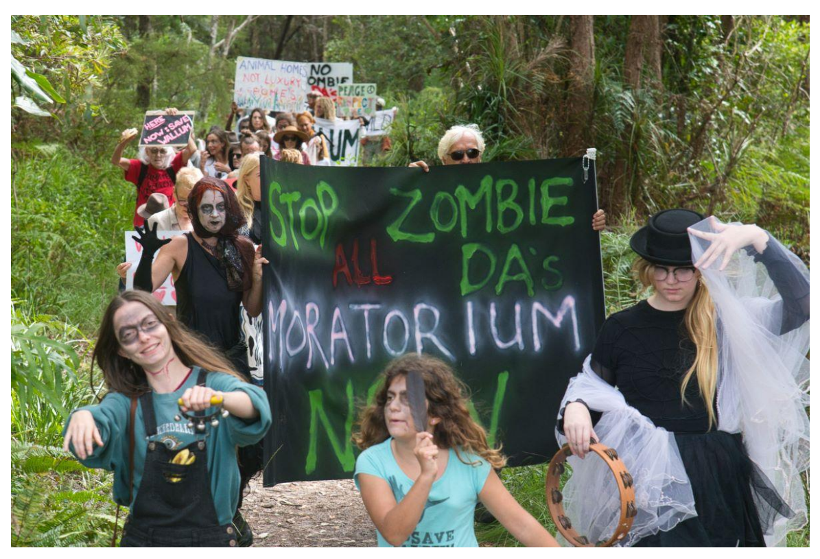
5) Save Wallum Zombie March